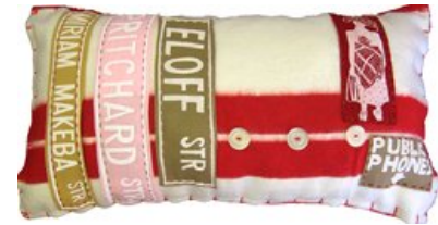
Inner City Blanket Cushion – olives YDA-CUSHIONOLI