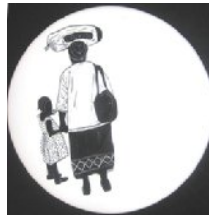
Potato Lady Plate YDA-P-PLADY