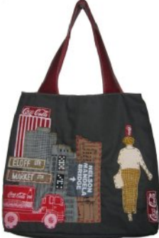
Yda Coke Bag Grey YDA - KOGREY