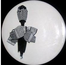
Basket Lady Plate YDA-P-BASK