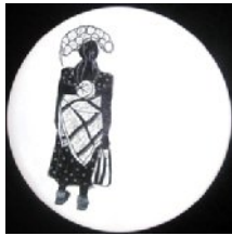
Potato Baby Plate YDA-P-PBABY