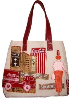
Yda Coke Bag Creme YDA - KOWHT