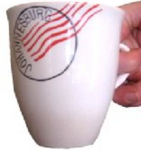
Johannesburg Mug YDA- JBG MUG