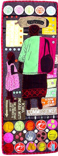
Potato Lady w/ Child YDA-POTATOLADY