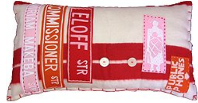
Inner City Blanket Cushion – reds YDA-CUSHIONRED