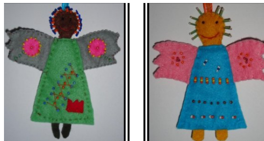
Zimele Angels 11x8cm with packaging Z-ANGELS