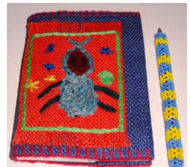
Zimele Notebook & Beaded Pen Z-NOTE 14x8cm with packaging

Zimele Developing Community Self-Reliance is a non-profit organisation dedicated to creating self-reliant and safe communities in rural Kwazulu-Natal. Zimele is Zulu for 'standing on your own two feet', which is what Zimele aims to do. Zimele works with more than 80 women in rural areas, many of whom are head of households.