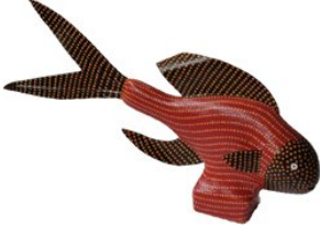
Painted fish M 78cm THEM/003 S 60cm THEM/004 XS 23cm THEM/005