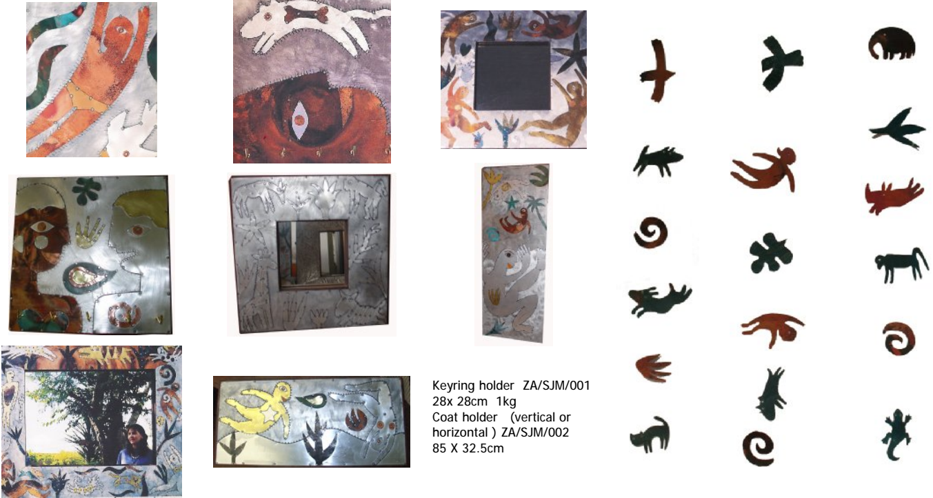
Mirror S Horizontal ZA/SJM/003 68 x 44cm 5kg Vertical ZA/SJM/004 44 x 68cm 5kg square ZA/SJM/005 40 x 40cm 4kg