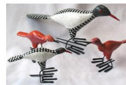
Painted bird M 35cm THEM/010 350g S 28cm THEM/011 tiny 15cm THEM/012