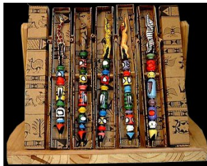
Afripen stand (holds 7 pens) AFP/012