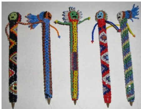
Zimele Happy Pens 13cm with packaging Z-HAPPY