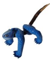
Painted dragon S 32cm THEM/001 510g XS 25cm THEM/002