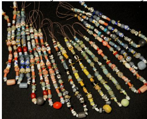
ATB-NECKSM Trade Bead Necklaces on 1mm leather cord Beads may be taken off and rearranged 56g