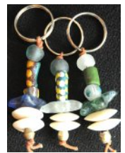
ATB-THINBONE Thin Bone 28g 2.5x7cm

Keyrings come with an optional African Trade Beads product tag (featured above). Length measurement is beads only.