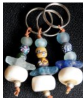
ATB-BONE Big Bone 28g 3x6cm