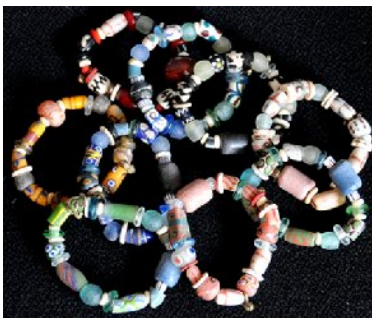
ATB-BRACE Trade Bead Bracelets 28g