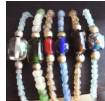
ATB-FLOWER Glass Flower Beads 13g