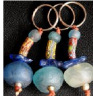
ATB-AQUA Big Aqua Glass 54g 3.5x7cm