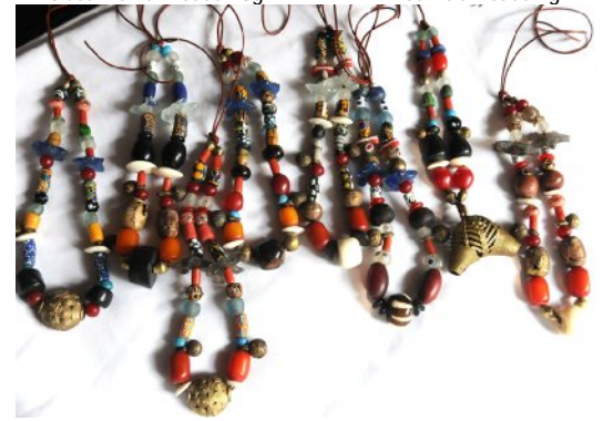
ATB-NECKLG Trade Bead Necklaces on 1.5mm leather cord Beads may be taken off and rearranged 123g

All items beads come from throughout Africa; Ghana, Mali, Nigeria, South Africa, Ethiopia and many other countries. Bracelets are strung with either single or double elastic cord; necklaces on 1mm brown leather cord. Bracelets are 17 – 18cm long; necklaces have 40cm of beads strung on leather cord.