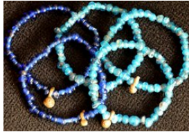
ATB-COCO Small Cocoina Beads 9g