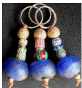
ATB-BBGS Big Blue Glass 51g 3.5x7cm