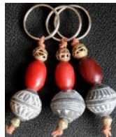
ATB-TOUAREG Terracotta & amber 29g 2.5x7cm