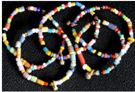
ATB-XMAS Christmas Beads 5g