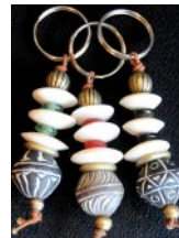
ATB-MTLBNE Metal & Bone 47g 3x7.5cm