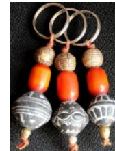
ATB-MALI Terracotta & amber 29g 2.5x7cm