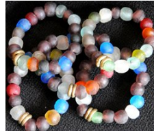
ATB-MXDGLASS Mixed Glass Beads 32g