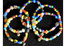
ATB-ASIA Mixed Asia Beads 9g