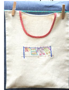
OOA014 Clothes Peg Bag