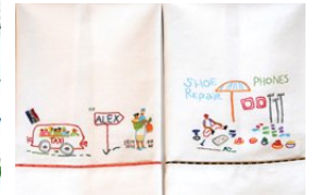
OOA005 Cotton Hand Towel