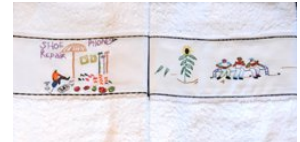
OOA010 Terry Towel