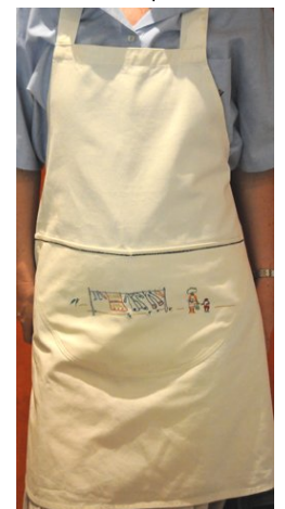
OOA020 Full apron

Out of Alex is an embroidery project working with women groups in various townships around Johannesburg. Allow 4 – 6 weeks for delivery. Each design is individually made onto cotton or linen. Some options for other colours for smaller items – enquire for custom orders.