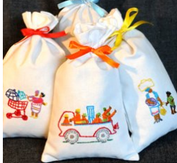
OOA002 Fragrance bags (without inner)