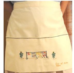
OOA015 Half Apron