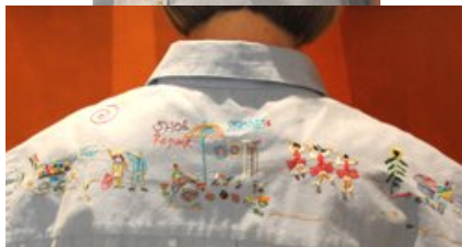
OOA016 Short-sleeve blue shirt S, M, L OOA017 Long-sleeve blue shirt S, M, L