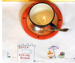
OOA008 Cotton Tray Cloth