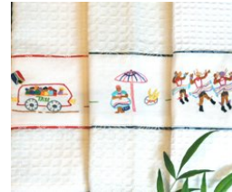
OOA004 Kitchen Towels