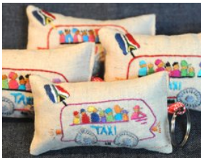
OOA001 Taxi Keyrings

Out of Alex Embroidery designs depict daily life the people living in South African townships. Designs and colours will vary with each item.