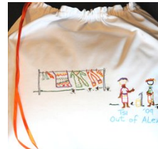
OOA009 Laundry Bag