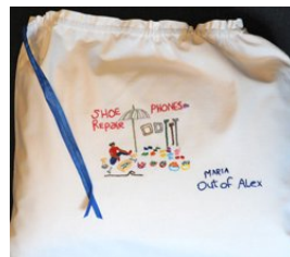
OOA013 Shoe Bag