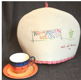
OOA011 Tea Cosy