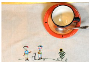
OOA007 Linen Tray Cloth