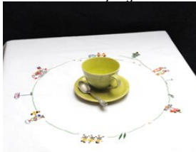
OOA006 1m Tablecloth