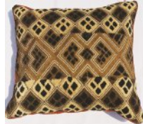
Shoowa Cushion with piping 50x50cm CON/SHO/004