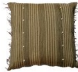
Olive SWC/019 M 020 S