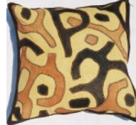
Kuba Cushion with piping - brown 50x50cm CON/KUB/004