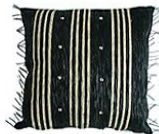
Zebra SWC/007 M SWC/008 S