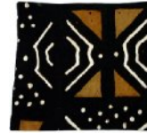
Traditional BOG/013 40x40cm BOG/014 50x50cm

Bogolon Cushion 40X40 Bogolon Cushion 50X50