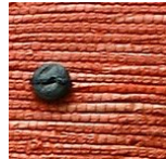
SWC/001 M 38.5x38.5cm SWC/002 S 28x37.5cm