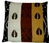
Bogolon Stripe BOG/010 40x40cm BOG/011 50x50cm