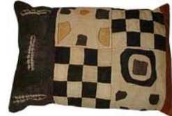
Kuba 40x50cm KUB/001 45x60cm KUB/002