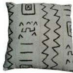
Bogolon White BOG/004 40x40cm BOG/005 50x50cm