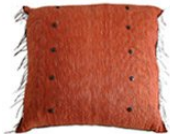
Swazi Cushion Rust