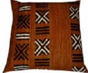
Bogolon Brown BOG/001 40x40cm BOG/002 50x50cm