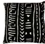
Bogolon Black BOG/007 40x40cm BOG/008 50x50cm